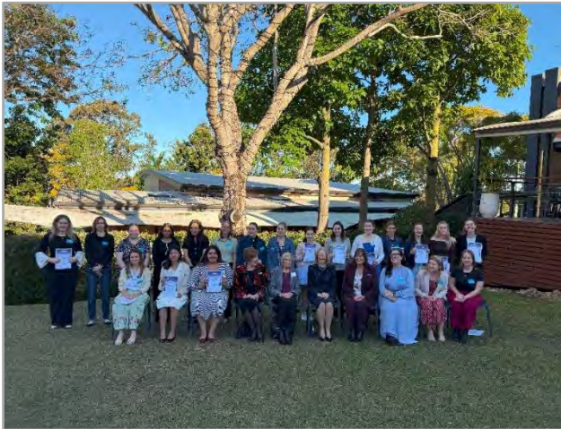
Recipients and sponsors with the Governor

With the presentation at the Playhouse, Women's College UQ, followed by afternoon tea in the foyer, we had the opportunity for much mingling. NCWQ Patron, The Honourable Dr Jeanette Young AC PSM, Governor of Queensland was gracious in the time she spent chatting with attendees and taking part in photos.